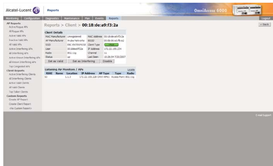
Figure 2 Detailed client status report

Alcatel-Lucent Remote APs are ideally suited for providing secure mobile connectivity to branch and home offices. All security policies are centrally defined and enforced on Alcatel's mobility controller.